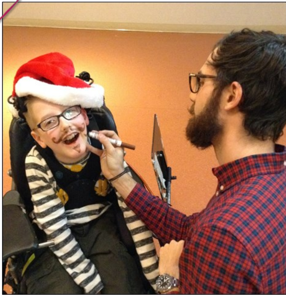
All smiles at the “barber shop”